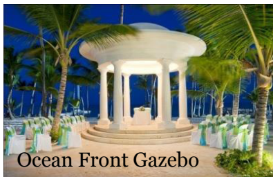
Ocean Front Gazebo

The Barceló Bavaro Grand Resort All-Inclusive has a unique location on Bavaro Beach, with a 2 kilometers beach of fine white sands with turquoise water in the region of Punta Cana.